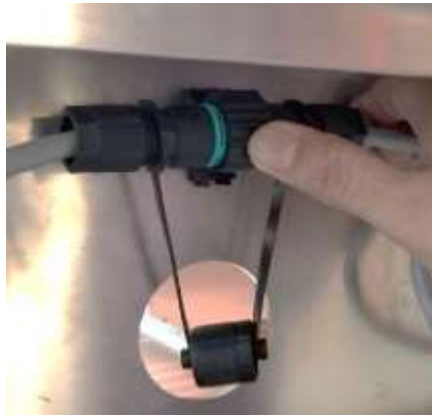
Figure 1: Techno Quick Disconnect

All Techno connectors are affected by this, including the quick disconnects, motor quick disconnects and junction boxes, and must be field-retrofitted. All equipment with Techno connectors, including the standard 24V DC Platinum line, the P10, and the XCM are affected and will be corrected.